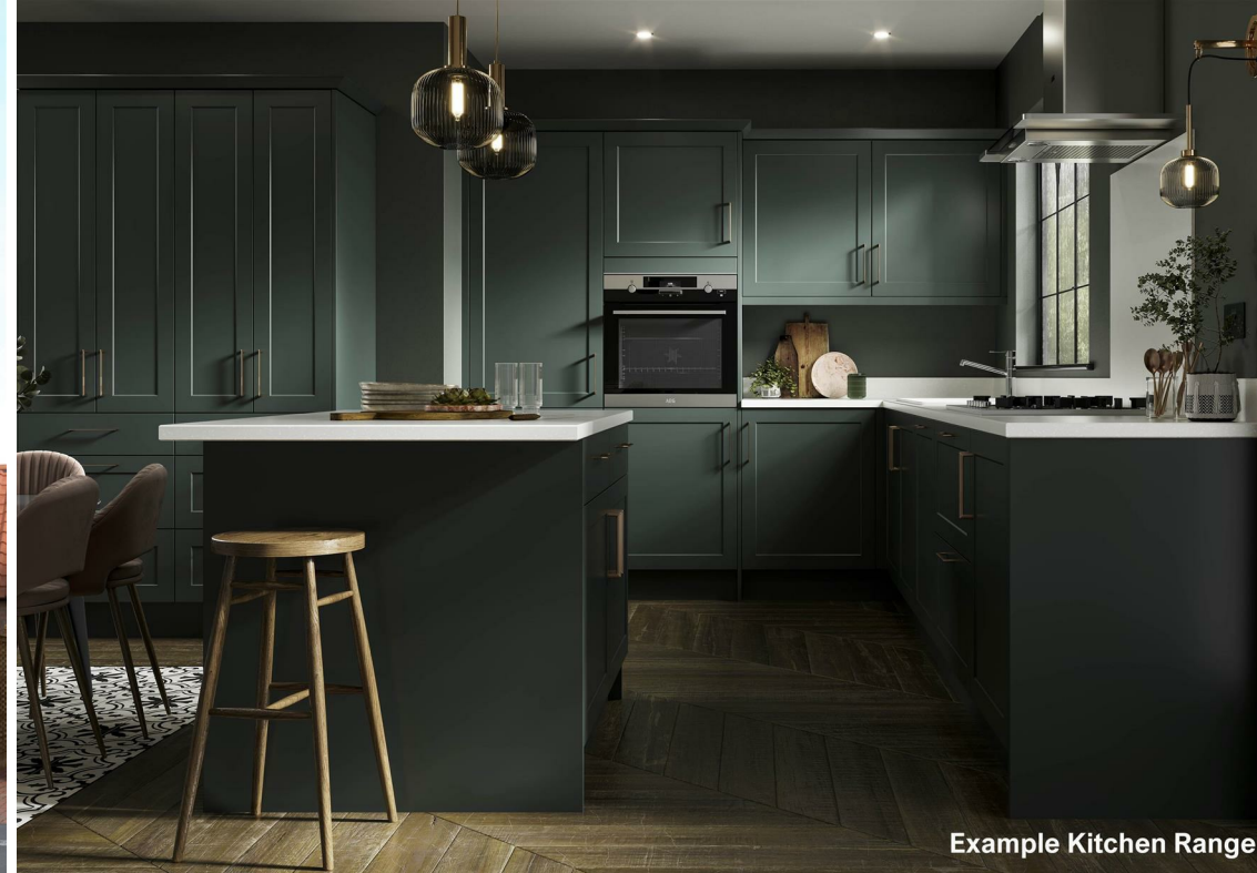
Example Kitchen Range