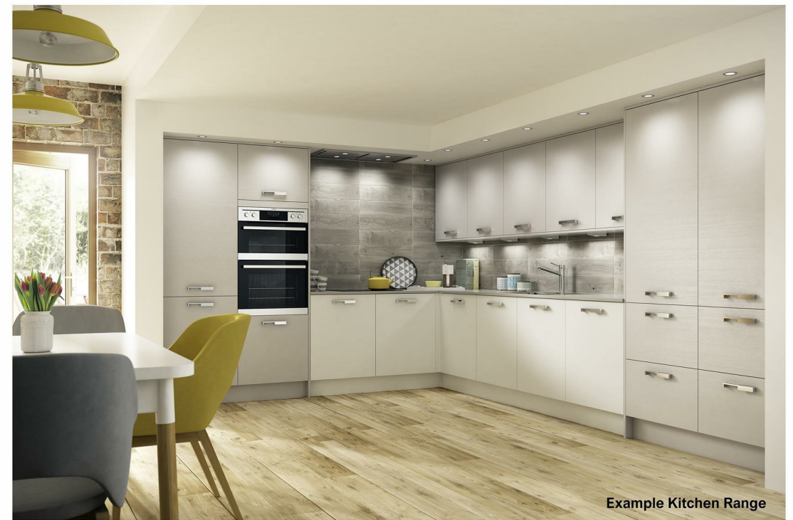
Example Kitchen Range