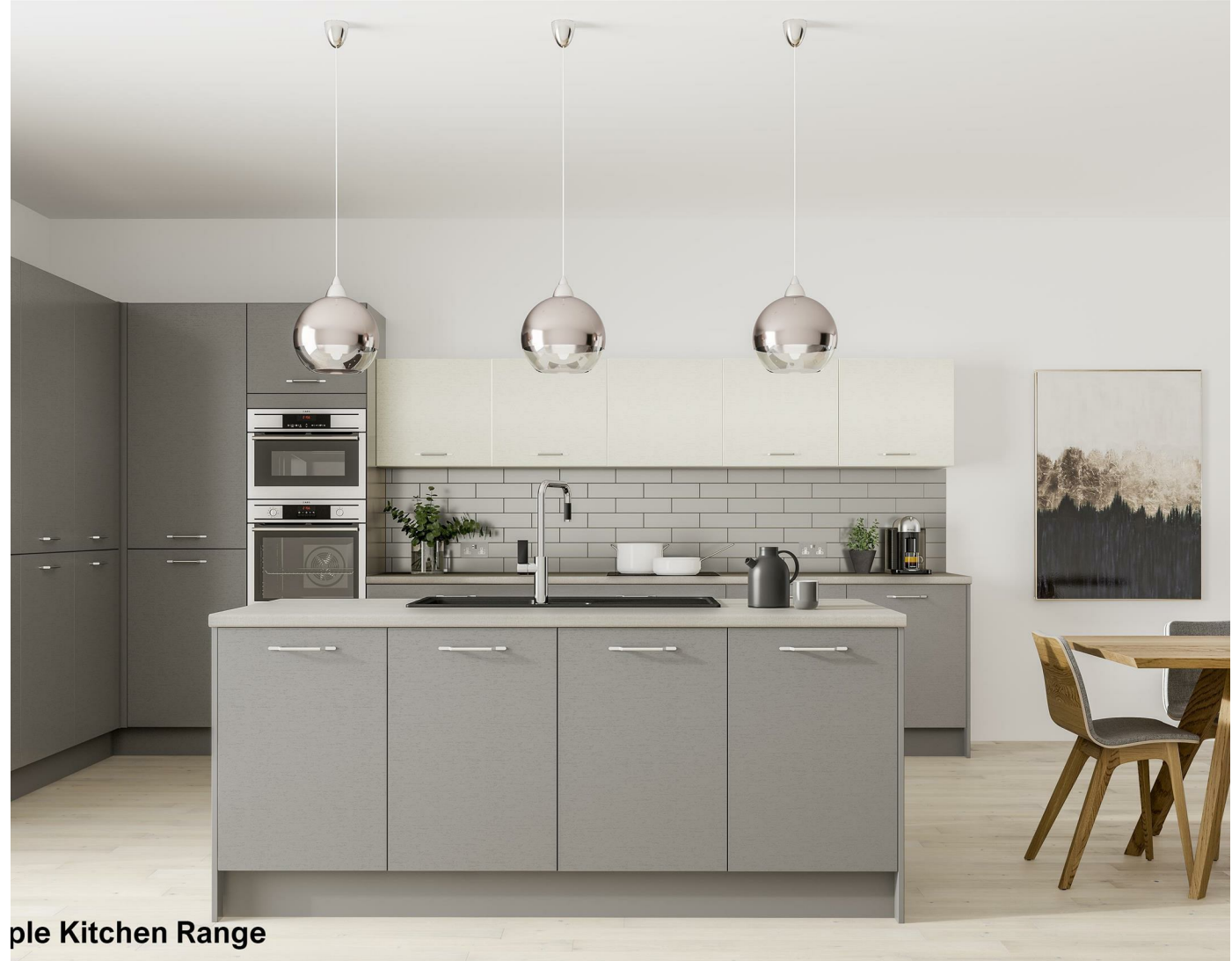
ple Kitchen Range